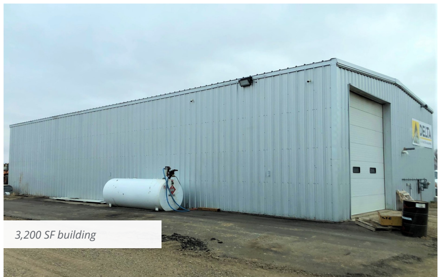
3,200 SF building