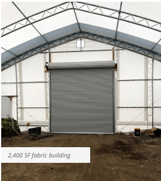
2,400 SF fabric building