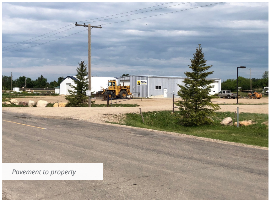
Pavement to property